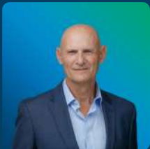
Juan Carlos Izpisúa Belmonte